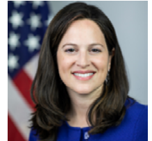
Anne Neuberger Deputy National Security Advisor, Cyber & Emerging Tech at National Security Council, The White House