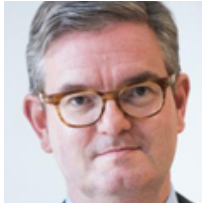
Sir Julian King Commissioner for the Security Union, European Commission