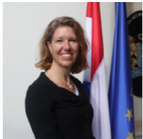
Nathalie Jaarsma Ambassador at-Large for Security Policy and Cyber, Kingdom of the Netherlands