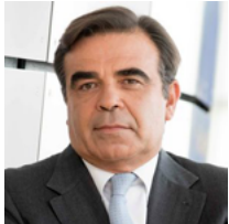
Margaritis Schinas Vice President, Promoting our European Way of Life, European Commission