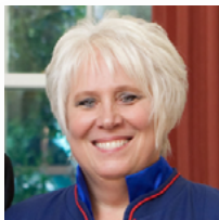
Marina Kaljurand Member, European Parliament