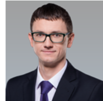
Karol Okoński Secretary of State, Ministry of Digital Affairs, Government Plenipotentiary for Cybersecurity, Poland