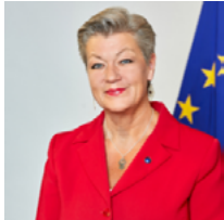
Ylva Johansson Commissioner for Home Affairs, European Commission