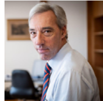
Joao Gomes Cravinho Minister of Defence, Republic of Portugal