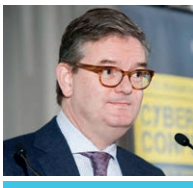
Sir Julian King Commissioner for the Security Union, European Commission

* Job titles and organisations at time of the conference